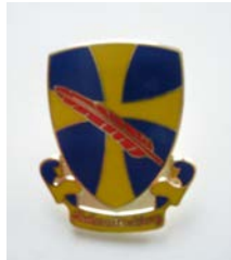
Original Red Feather Shield Pin