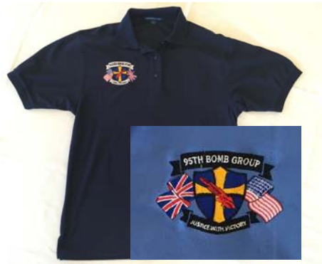
Polo Shirt (Men's & Women's)