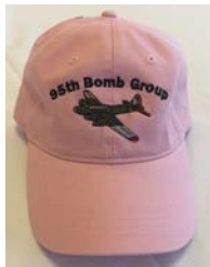
Canvas Low Profile Hat