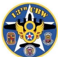
13th Combat Wing