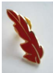
Red Feather Pin