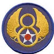
8th Air Force