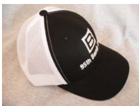
Black & White Summer Mesh Hat