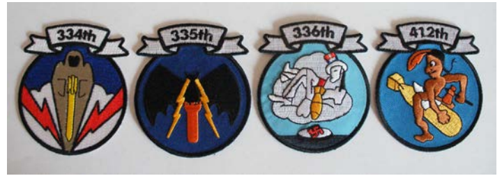
95th BG Squadron Patches