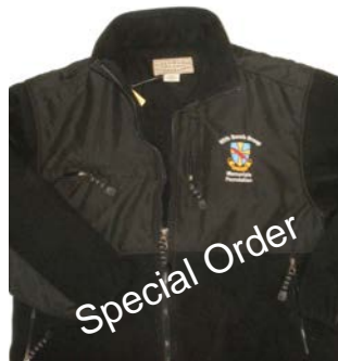
Polar Fleece Jacket with Red Feather Shield