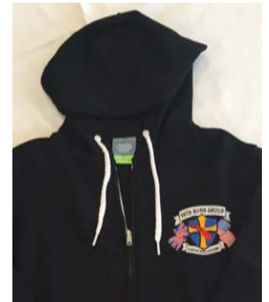
95th Full Zip Fleece