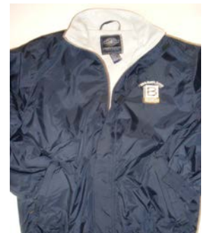
Lined Nylon Shell with Square B