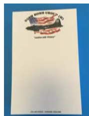
5" x 8" Notepads