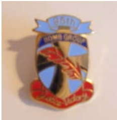
Red Feather Crest Pin