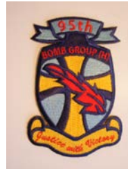
Red Feather Crest