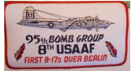
Small Rectangular B-17 Patch