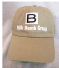
Canvas Low Profile Hat