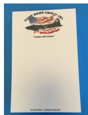
5" x 8" Notepads