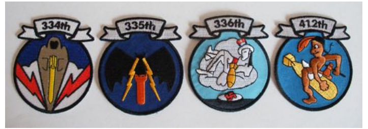
95th BG Squadron Patches