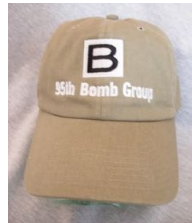
Canvas Low Profile Hat