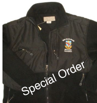
Polar Fleece Jacket with Red Feather Shield