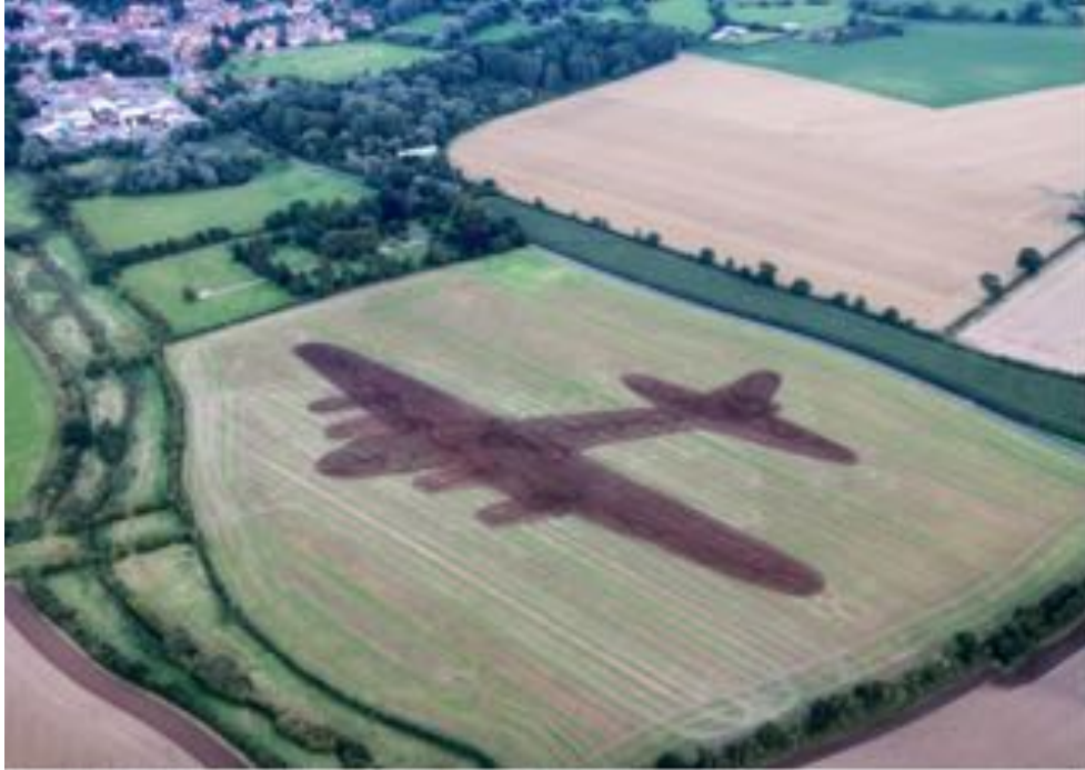
An aerial shot of the B-17 Bomber drawn into a field in Eye.