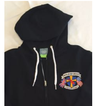
95th Full Zip Fleece