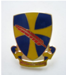
Original Red Feather Shield Pin