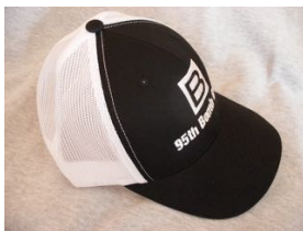
Black & White Summer Mesh Hat