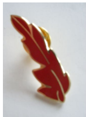
Red Feather Pin