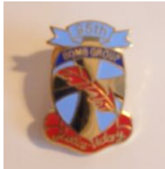
Red Feather Crest Pin