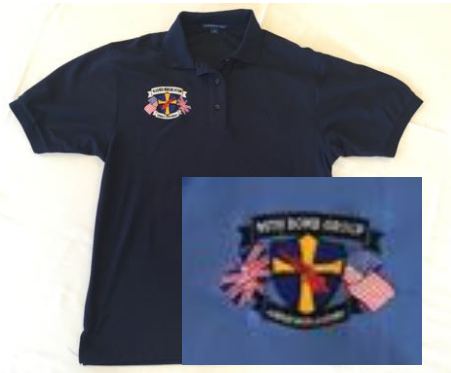
Polo Shirt (Men's & Women's)