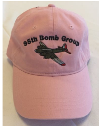
Canvas Low Profile Hat