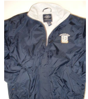
Lined Nylon Shell with Square B