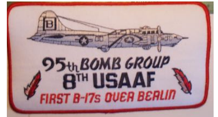
Small Rectangular B-17 Patch