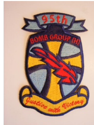
Red Feather Crest